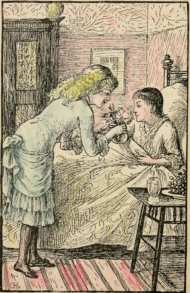
"IT'S A ROSE FROM ROSY."—Page 219.